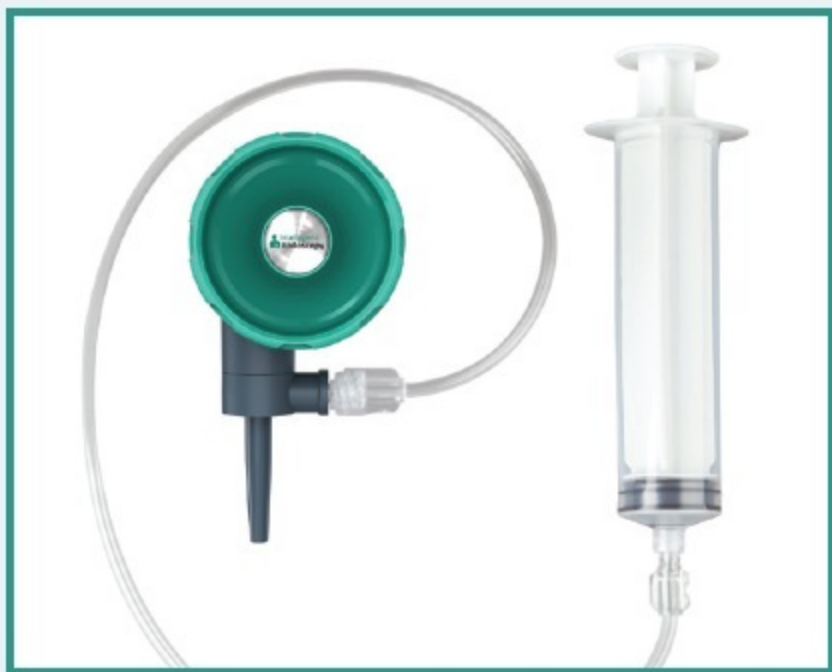
A dedicated flush port and connector tube makes flushing the endoscope channel fast and easy keeping it clean and free of debris.