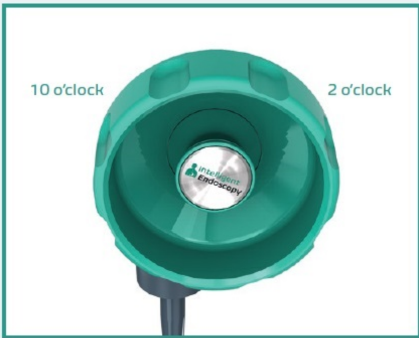
Predictable band deployment using modern, ergonomic science with just a natural twist of the wrist to deploy each band and prepare the next band for deployment.