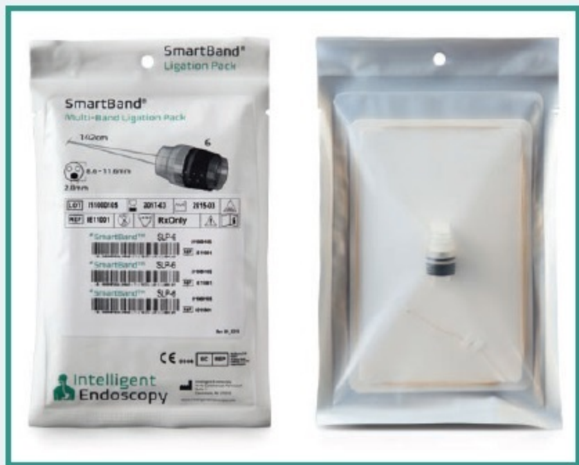
The SmartBand Ligation Pack, "SmartPack", is now available when more bands are needed to complete the procedure.