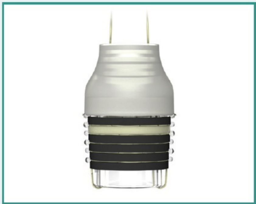
High Retention Bands (HRB) deliver the band performance needed to treat the patient with a 24-month shelf life.

Used to endoscopically ligate esophageal varices at or above the gastroesophageal junction and to ligate internal hemorrhoids.