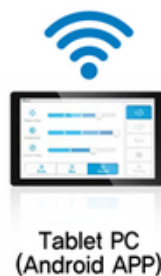
Tablet PC (Android APP)